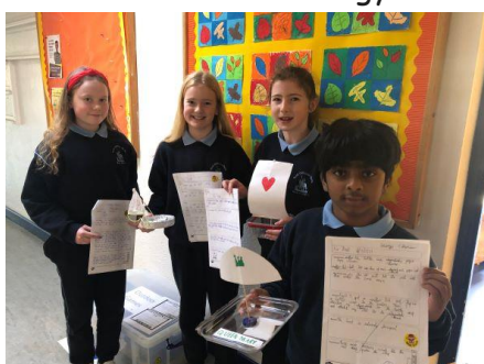
catapults in 6 th class