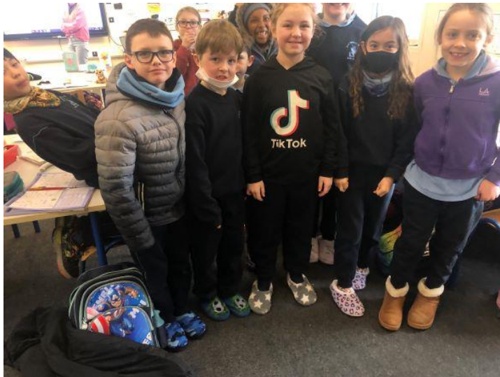
Friendship poems were written.