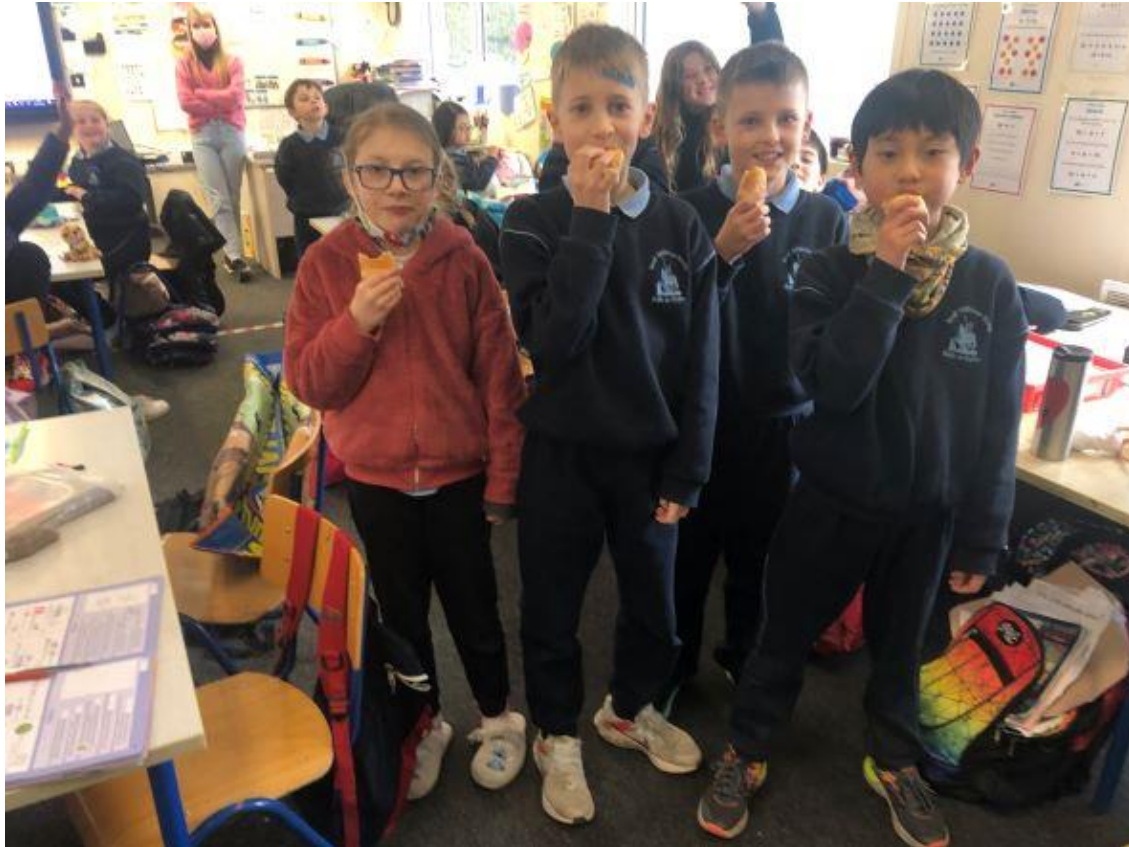
Cosy slippers were worn.