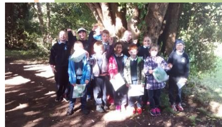
A beautiful day learning about our native trees.