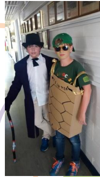
Roald Dahl Day