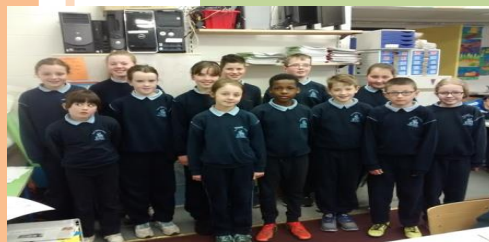
The Committee supported by the parents.

The yellow Flag Committee will attend a ceremony on the 26 th of April to formally receive the yellow Flag for the school.