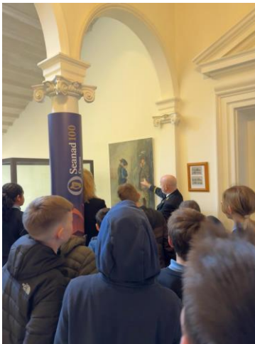
Learning all about the Seanad.

Thank you for reading our newsletter. It is available on our website www.balrotheryngs.com . The website has current information on it. There is a rolling banner with notices that has reminders about events coming up. This is the best way to check what is happening at school.