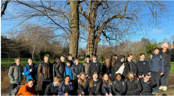
Beautiful day in Merrion Square.